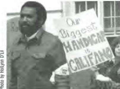
Machinists' leader supports Washington demonstrators

Ultimately the most important thing about the 504 sit-ins, rallies and meetings is the fact that they achieved federal civil rights coverage for Americans with disabilities for the first time, and the basis was laid for the ADA years down