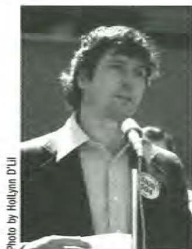
Tom Hayden speaking at 504 rally

Rights Act of 1964 and to Title IX of the Education Amendments of 1972.