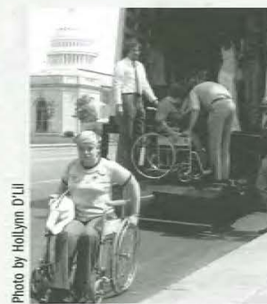
Machinists and CRLA lawyers unload demonstrators from UHAUL truck