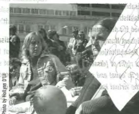
504 protest rally