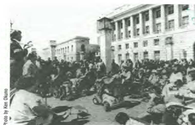
Rally outside San Francisco HEW building

At the time, the Black Panthers were operating a program which provided free meals before and after school to hun-