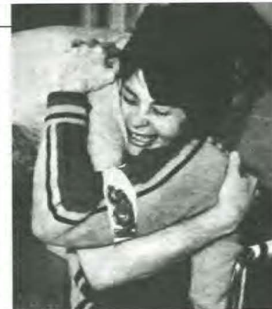
Jubilant demonstrators after 504 victory announcement

The New York Times, Associated Press, April 11, 1977