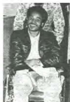
The Black Panther , May 7, 1977