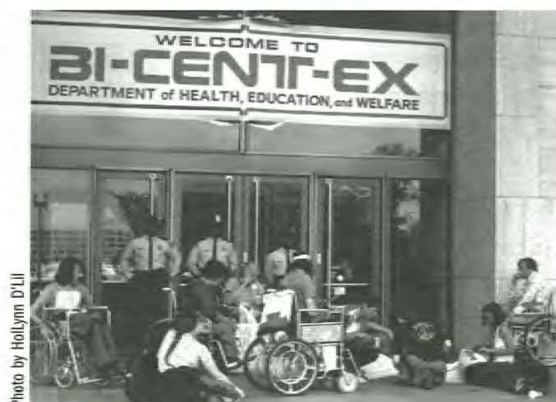
California contingent demonstrates outside DC HEW headquarters

The victory could not have been won without support from our political allies and the general public.