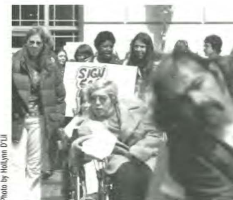
Victory march from the building

HEW, charged with responsibility for developing regulations, stalled, mired in disagreement and conflicting opinions about how to translate the equal opportunity/equal citizenship mandate set forth in Section 504 into practical steps for entities required to comply with the law. Disgusted with the endless delays, national disability organizations notified HEW that nationwide demonstrations were being planned if regulations weren't published by early April 1977. Unmoved by the threats, HEW ignored the notice. Committed to the tactic of civil disobedience, people with disabilities in cities across America took to the streets to focus attention on HEW's failure to issue 504 regulations. In the longest takeover in U.S. history, activists in San Francisco occupied the Federal Building for 25 days. Circumstances surrounding the demonstration evoked the character of the disability movement and Section 504 itself. People with diverse disabilities and parents and families of children with disabilities sat in, confirming that their issues and concerns sprang from common experience, transcending race, gender, age, class and diagnosis. Public and political support was broad based and enthusiastic. After public hearings, national media attention and an escalation of pressure by a delegation sent to Washington from the San Francisco