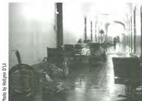
Nighttime in the HEW building

In 1978, the Department of Transportation issued 504 regulations applying to publicly operated transit districts nationwide. In order to fulfill 504's non-discrimination requirements, transit authorities would be required to provide lifts on buses and take specific steps to provide access to other public transit systems such as subways and